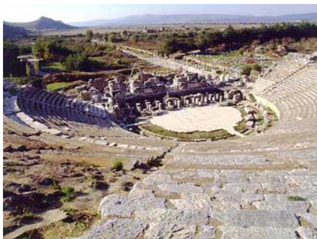
Theater at Ephesus

We think that John wrote while living near the Asian town of Ephesus, in modern Turkey. History tells us that John lived there before he died. The Gospel of John describes Jesus' healing (John 5); Jesus and bread (John 6); and Jesus' turning water to wine (John 2). Dionysius (the god of wine), Asclepius (the god of healing), and Demeter (the goddess of bread) were all three important gods in Ephesus. John wanted the church to see that Jesus is greater than all gods.