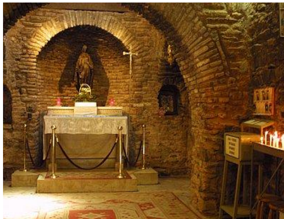
Ancient House of Mary Mother of Jesus

In 1 John the apostle is addressing a problem in the church. It seems that the church struggled with their faith and faithfulness. John calls them to stay faithful and remain ( meno is used 24 times) in Jesus. He often contrasts staying and going. Those who leave were not really part of the group (2:19). The antichrists were opposed to the work of Jesus and went out from the church. They left and will pass away, as will the world (2:16). Remaining in Jesus involves loving each other.