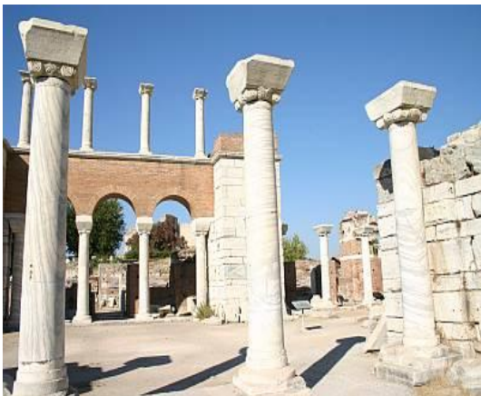
Basilica of St. John the Apostle